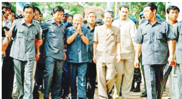
King Norodom Sihanouk and Akashi Yasushi, UN Representative for UNTAC. Japan has played an active role in building peace in Cambodia.