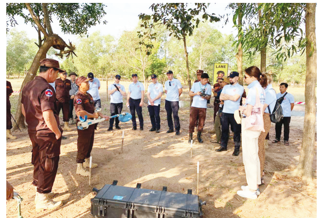
The Cambodian Mine Action Centre (CMAC), with support from JICA, provides training to Ukrainian demining officers in January this year.