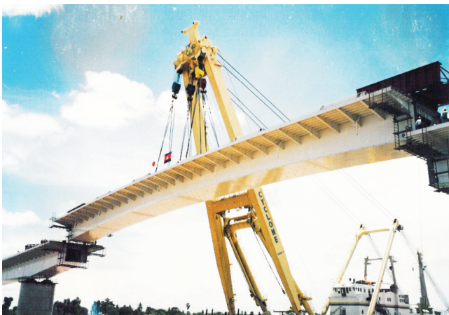
The destroyed central span of Phnom Penh's Chroy Changvar Bridge is replaced in 1993.