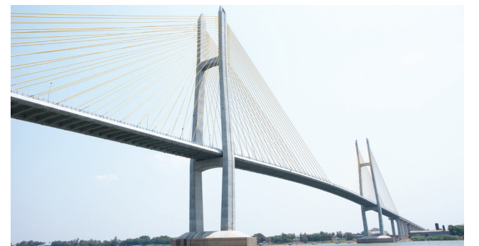
The Neak Loeung Bridge, also called the Tsubasa Bridge, linking Kandal and Prey Veng provinces was constructed with Japanese ODA.