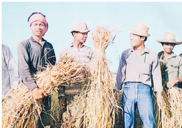
A Japan Overseas Cooperation Volunteers (JOCV) specialist works with rice farmers in Battambang in the 1960s.